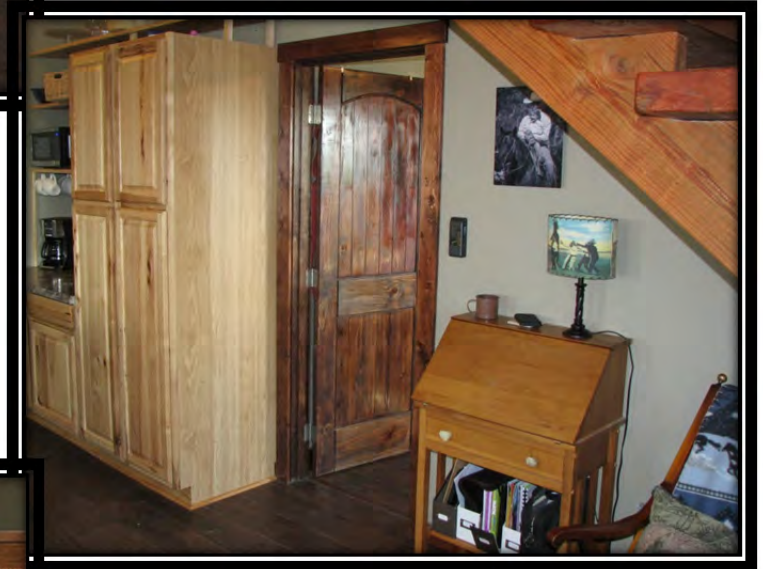
Door to Master Bedroom