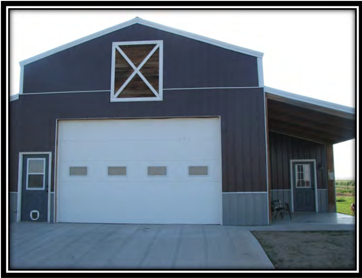
Door to right leads to the Home Section