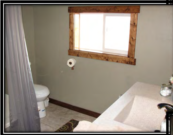
Full Bath Upstairs