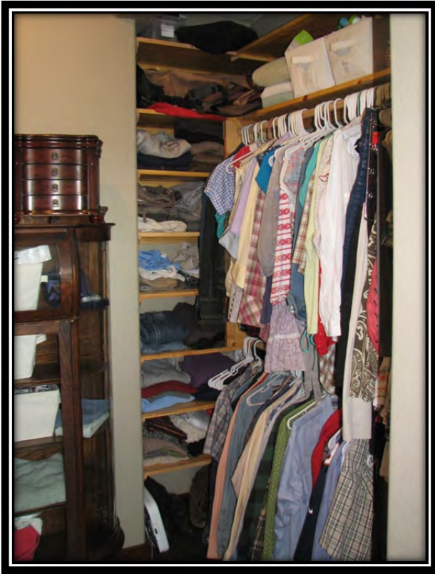
Master Walk-in Closet