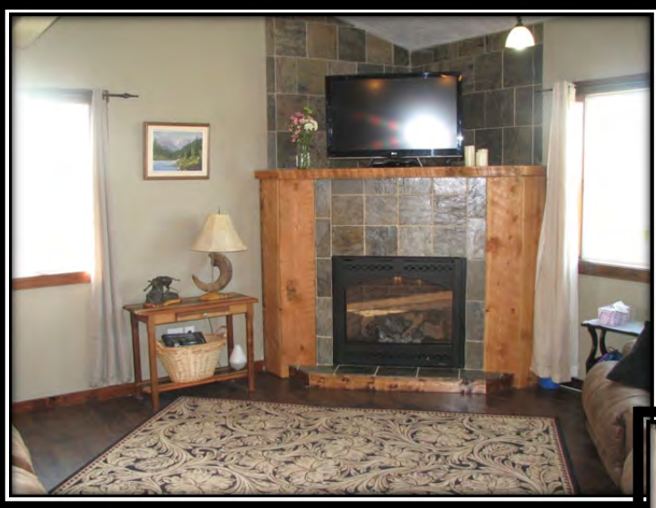
Gas Fireplace in Great Room