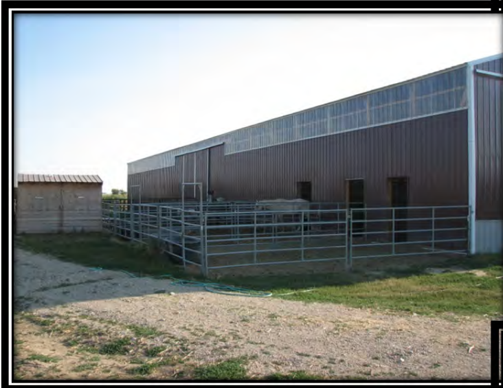
Outdoor Stalls & Runs